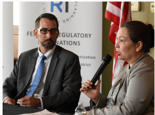
Clockwise from top left: Volunteers plant native plant plugs at Ken Rock Park in June to create a bioretention basin that will prevent pollutants from entering the Spring/Rock Creek watershed; Senator Tammy Duckworth spoke at R1 in April while in northern Illinois to explore high-tech industry projects; The annual Boone Winnebago County Trustee auction broke participation records, but more importantly, reduced the number of blighted properties in the region.

Biggest auction yet! The Land Bank administered Trustee Program auctions for Boone and Winnebago Counties, with 280 registered bidders and resulting in 170 property sales worth $1 million.