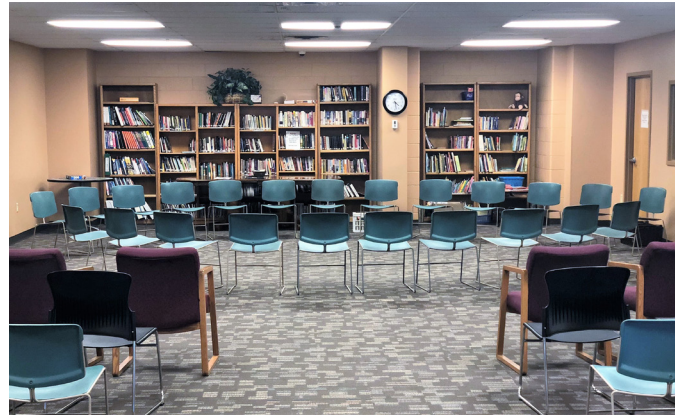
Room generously provided by Rockford Rescue Mission.

“If I can get up at the next meeting and speak, I will” and “Keep up the work and keep hope alive for offenders like me.”