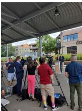
A nice turnout by local media at our July 16 th News Conference