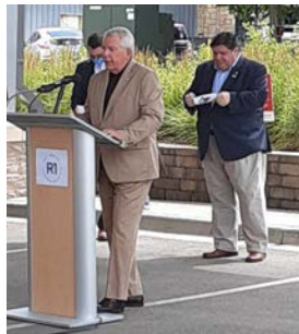
City of Belvidere Mayor Mike Chamberlain speaks at News Conference