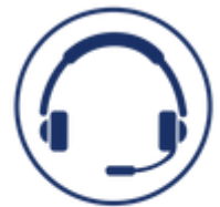
CUSTOMER SERVICE CALL CENTER