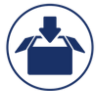
LOGISTICS & DISTRIBUTION

The Rockford Region consists of Boone, Ogle, Stephenson, and Winnebago counties in northern Illinois. The area lies in the heart of the Midwest, and in very close proximity to Chicago, Milwaukee, Madison, Quad-Cities, and Peoria. Its central time zone location allows your company to reach customers from coast to coast during normal business hours.